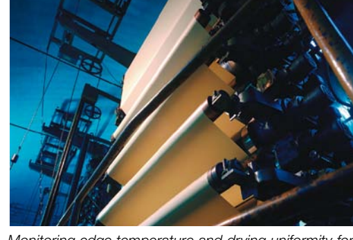
Monitoring edge temperature and drying uniformity for paper production results in higher yields and reduced downtime.