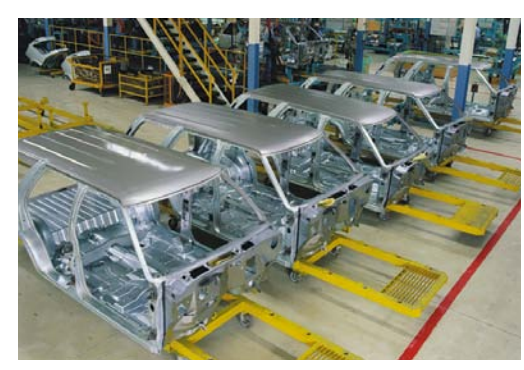
From paint curing to thermoforming, noncontact temperature measurement provides consistent product quality in the automotive industry.